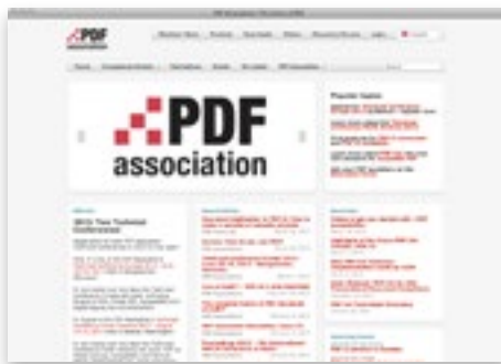
Start page of the PDF Association web site.

pants can learn strategies for their own companies to use when introducing and using accessible PDFs.